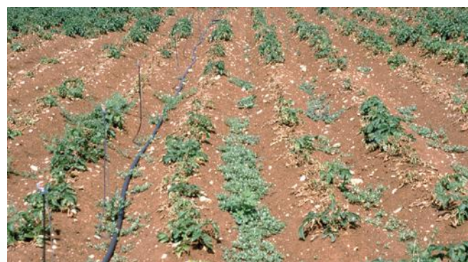
A potato crop showing patches of stunted and dead plants caused by a severe attack of the quarantine cyst nematode Globodera pallida .

The use of resistant cultivars in many areas has resulted in the selection of different race/pathotypes of the nematodes toward which resistance is not available. Also, the intensification of the cropping system, the frequent cultivation of the same or similar host crop plants on the same land is exacerbating the existing nematode problems, while the globalisation of trade has caused the introduction into Europe of new damaging nematodes and diseases in general. This is the case of the pine wood nematode, Bursaphelenchus xylophilus , the soybean cyst nematode Heterodera glycines , Globodera tabacum tabacum , Heterodera elachista , and the root knot nematodes Meloidogyne chitwoodi , M. ethiopica and M. enterolobii .