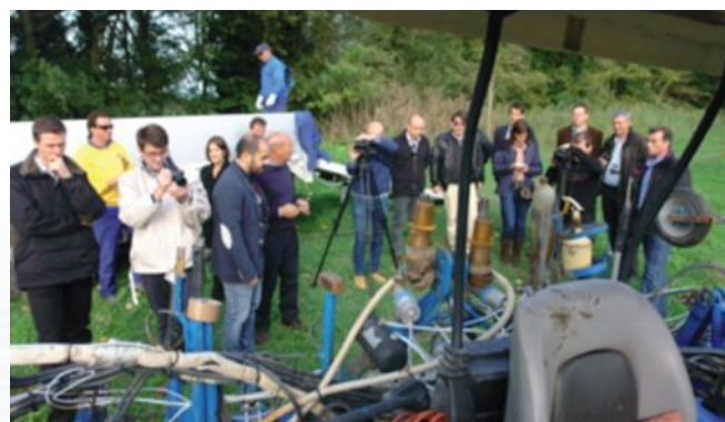
European stewardship training organised by Certis in Rome (Italy)