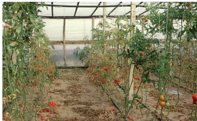
Tomatoes in a plastic house damaged by Meloidogyne spp.

available at least similar or preferably the same means of production, including effective solutions for the control of plant pathogens. The risk is that not only the high labour cost but also the lack of effective means of production, such as control solutions, will discourage nursery men from continuing their production activity in Europe and, instead, they will move to third countries thus aggravating the economic situation in Europe.