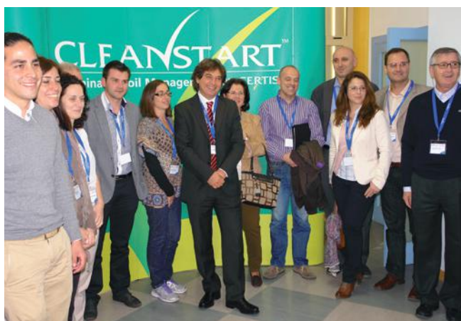
Participants of the conference in Almería (Spain)

The first, in April at the University of Almería, focused on protected crops. In this area of intensive production and sandy soils, soil disinfestation is a key measure to guarantee satisfactory quality and quantity.